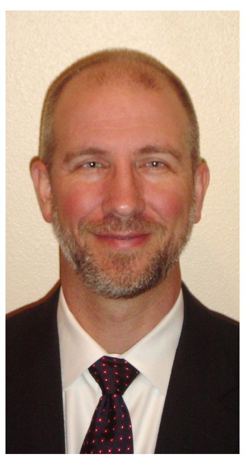
OCC District Deputy Comptrollers