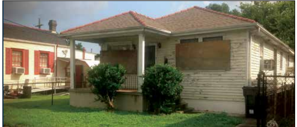
Before: A distressed bungalow before it was rehabilitated by Redmellon Restoration & Development, a real estate development company in New Orleans.

Changing demographics and market forces are driving up overall demand for rehabilitation financing, which totaled $220 billion in 2015. 1 Today's housing rehabilitation trends are fueled by strong sales of existing homes, which continue to