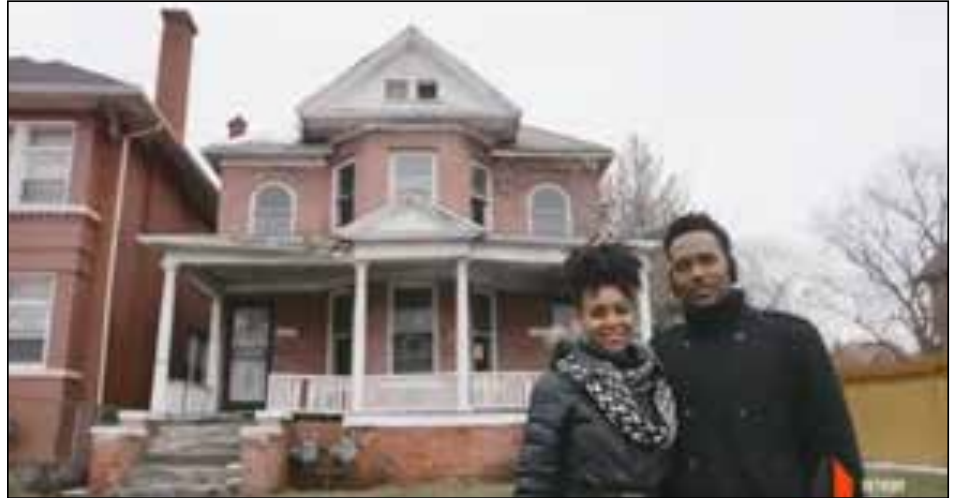
The Reinvestment Fund

In response to this problem, in February 2016 the Detroit Home Mortgage program was launched as a collaborative effort of local