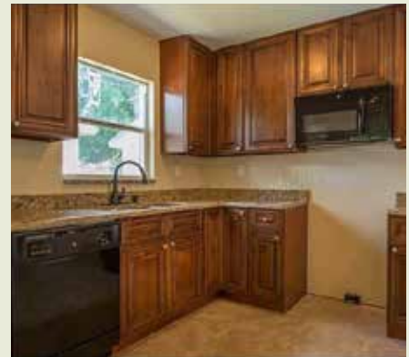
Florida Minority Community Reinvestment Coalition

Before and after: Rehabilitation of this home in Florida included a kitchen with new appliances, cabinets, and flooring, making it ready for a low-income family looking for an affordable home to buy.