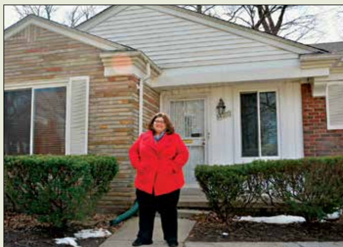
The Financial Services Consulting Group