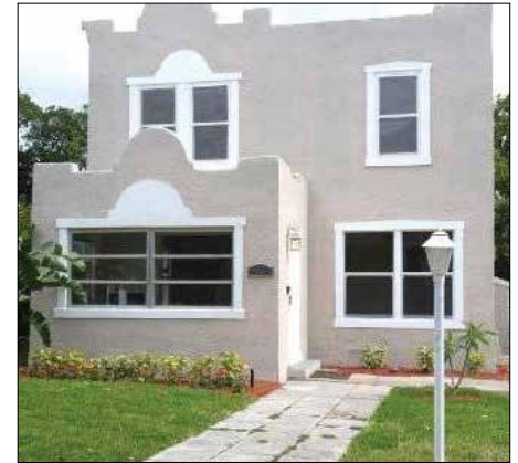
Florida Minority Community Reinvestment Coalition

Before and after: This deteriorated home in Northwood Hills, a historic area of Palm Beach County, Fla., was purchased and renovated through the NCST's First Look program. Many of its original 1926 features were restored, and the home was then purchased by a first-time LMI home buyer.