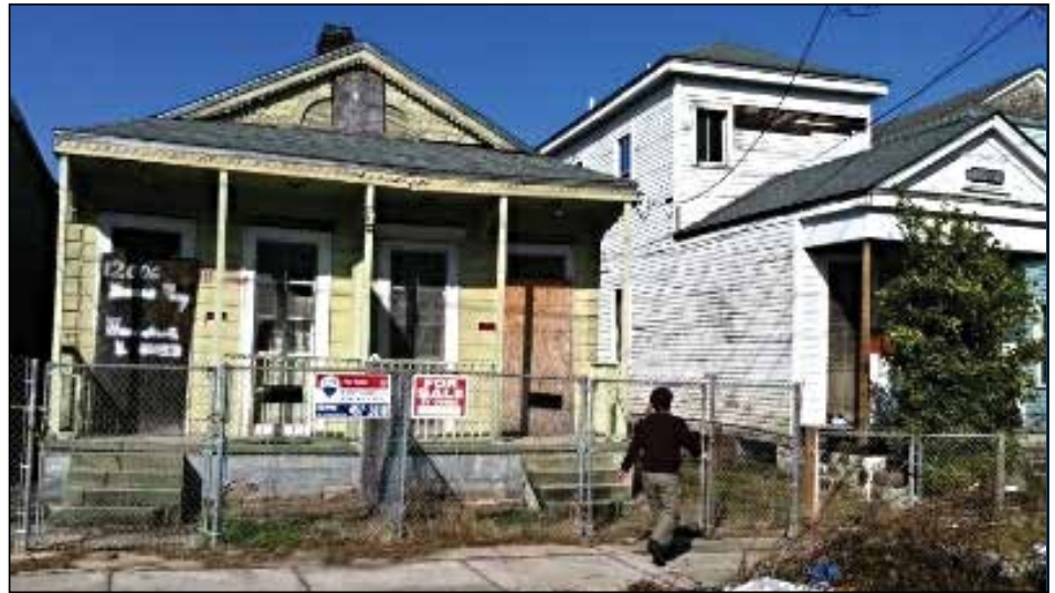
Before: Redmellon Restoration & Development took on a major rehabilitation of this abandoned duplex in New Orleans.

Existing interagency real estate lending guidelines include certain supervisory LTV limitations, including that owner-occupied residential mortgage loans in excess of 90 percent of property value should have appropriate credit enhancements. 2 These interagency