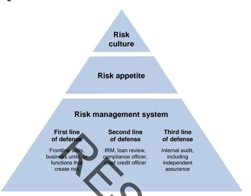
Figure 1: Risk Governance Framework

The framework should cover all risk categories applicable to the bank—credit, interest rate, liquidity, price, operational, compliance, strategic, and reputation. These categories of risk and their risk to the bank's financial condition and resilience are discussed in the "Bank Supervision Process" booklet of the Comptroller's Handbook . Risk governance frameworks vary among banks. Banks should have a risk governance framework commensurate with the sophistication of the bank's operations and business strategies.