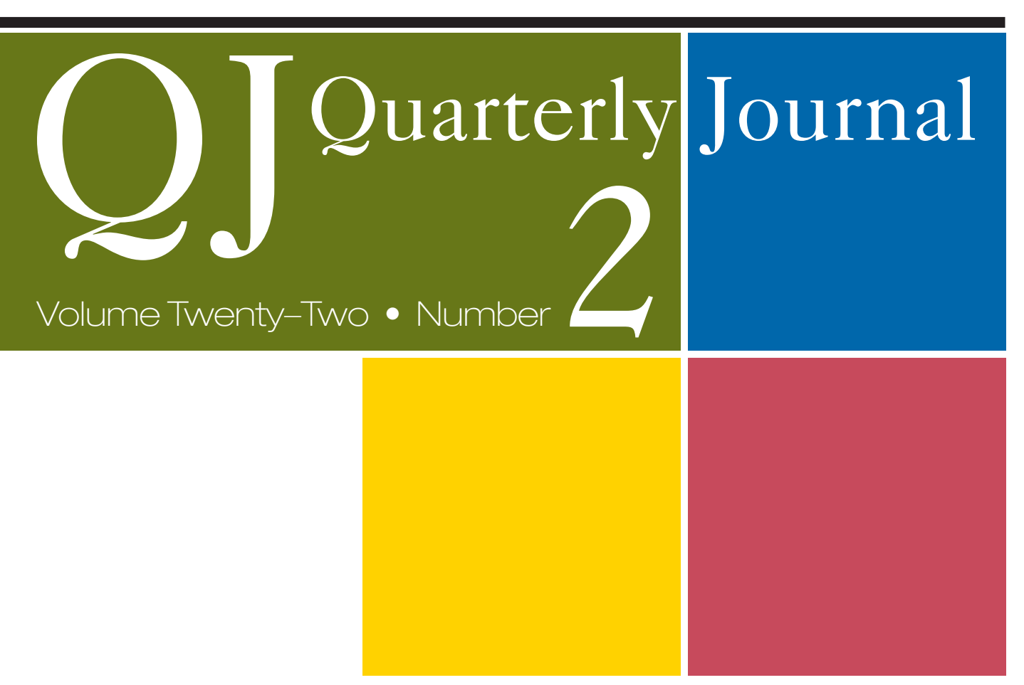
The Value of the National Bank Charter

Comptroller of the Currency Administrator of National Banks