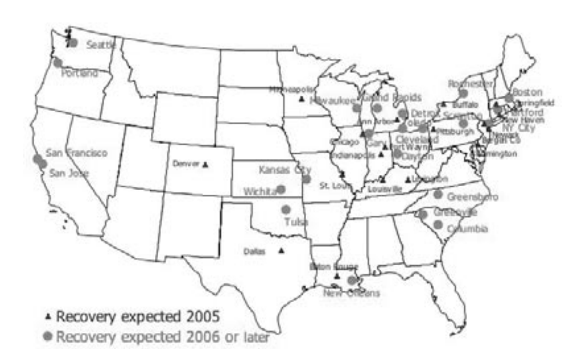
Figure 2—Some cities will lag behind the recovery. Metropolitan statistical areas not expecting recovery until 2005 or later.

As large banks have been moving into residential real estate, small banks have been expanding into business lending. At small banks, C&I lending is increasing by about 5 percent annually (it is shrinking at large banks), and business real estate lending by over 15 percent.